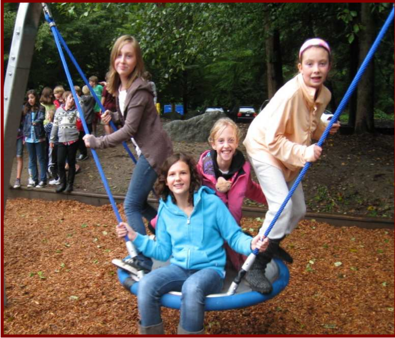
Check out these smiles!