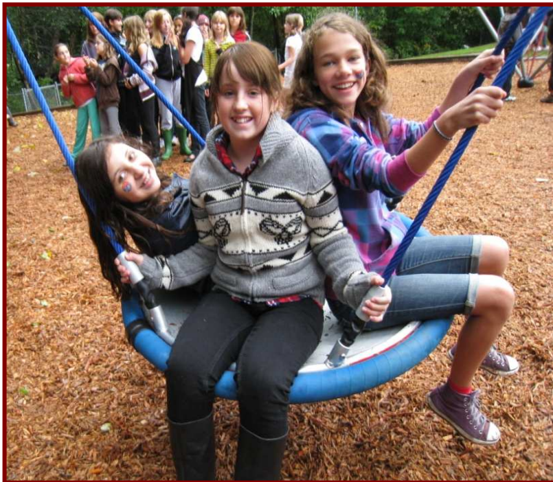
The saucer swings are a great hit!