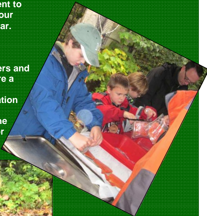
The Hunters and Fishers are a picture of concentration as they prepare the salmon for our feast.