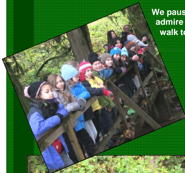
We pause for a moment to admire the trees on our walk to the Big Cedar.