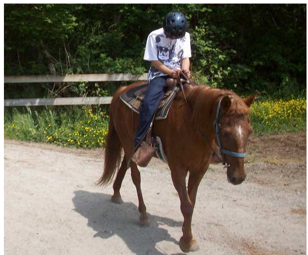
A shy grade seven rider at the Zajac Ranch