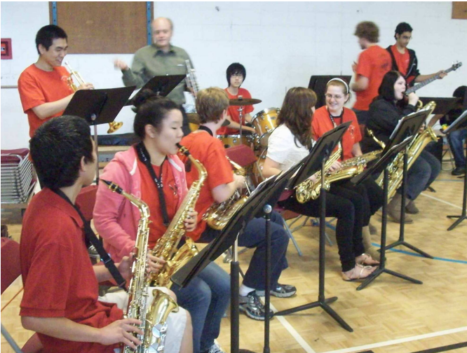
The PAC Barbeque had the Carson JAZZ Band Playing