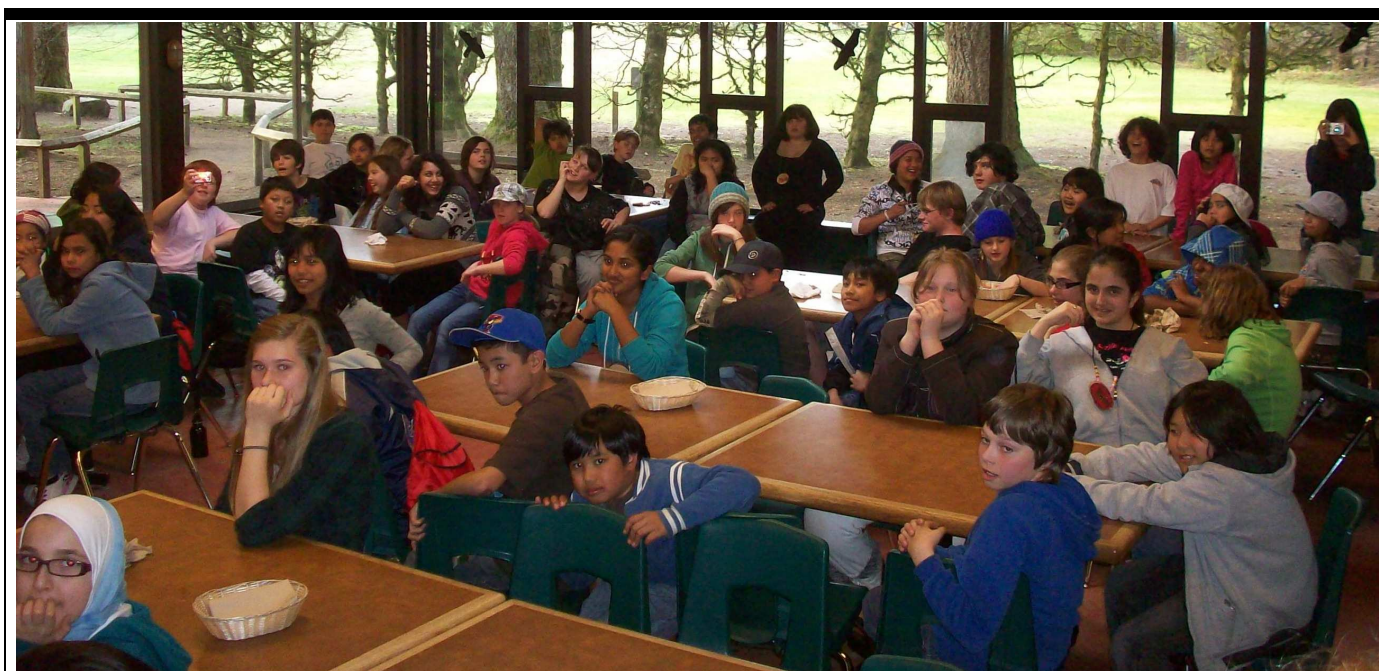
Queen Mary Grade 5 and 6 Students at Outdoor School – Dinner Time, April 14, 2010