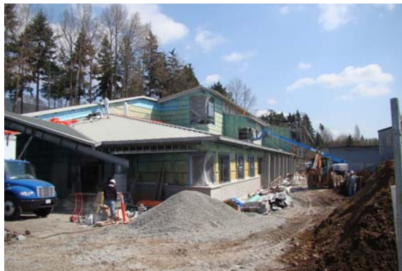
New Highlands Elementary School

On Friday, May 8 th at 1:15 p.m., students in North Vancouver School District will practise a Drop / Cover / Hold earthquake drill as part of National Emergency Preparedness Week.