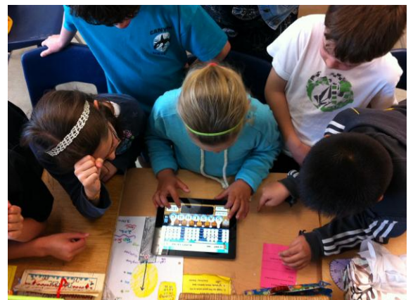
Ipad 2 pilot: Students in Div. 7 work cooperatively while viewing and reviewing the educational impact of Apps

Congratulations to all our students who have enthusiastically participated in Track and Field this year – they have had to participate under less than ideal weather conditions for most of this season. We have 50 students who will move on to the District Track Meet being held on June 7 th at Swangard Stadium – good luck everyone!