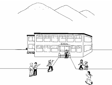
North Shore Schools Emergency Planning Program

For more information contact the North Vancouver School District. at 604 903-3444 or at www.nvsg44.bc.ca .